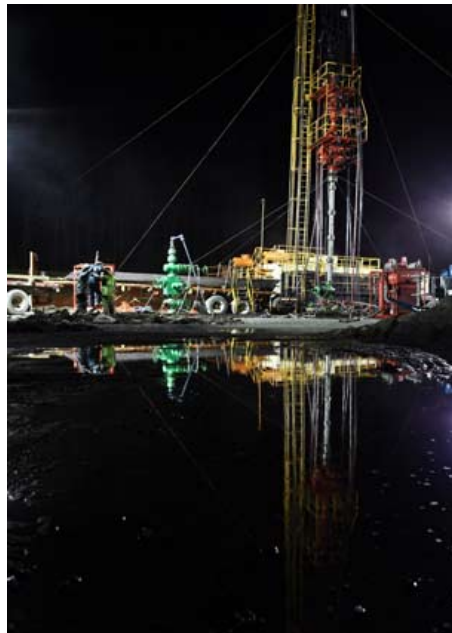
Natural gas wells owned by Cabot Oil and Gas in Dimock, Pa., in December 2009.

James Hansen's eye-opening article, " Game Over for the Climate ," brought widespread attention to the Alberta Tar Sands in Canada as a source of carbon which, if tapped, would lead to irreversible global warming. There is another climate bomb in the United States, shale gas hydraulic fracking, which emits methane, more dangerous than CO2. While many rhetorically call natural gas a bridge to the clean energy future, new information is showing the opposite; natural gas will hasten climate change, poisons the air, land and water, and carries unacceptable risks to our health.